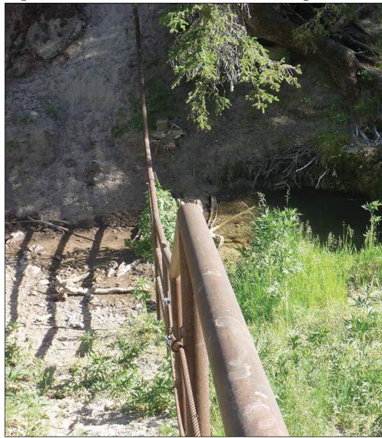
It appears the habitat protection project funded by sportsmen and built around sensitive riparian habitat in Lincoln National Forest is having the intended effect. In this photo taken several months after work finished, the left side is the area open to cattle while the right side is protected for wildlife.